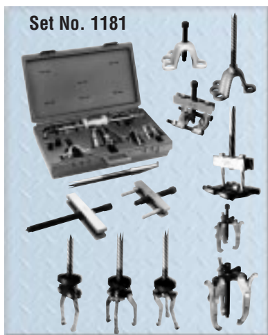
Set No. 1181