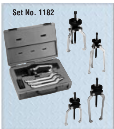
Set No. 1182

No. 1122 – Bearing pulling attachment for use with No. 1027 and No. 7393 pullers. Has 2" max. spread, 1/8" min. spread.