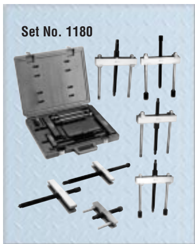
Set No. 1180

Convenient, portable puller sets that go where you do.