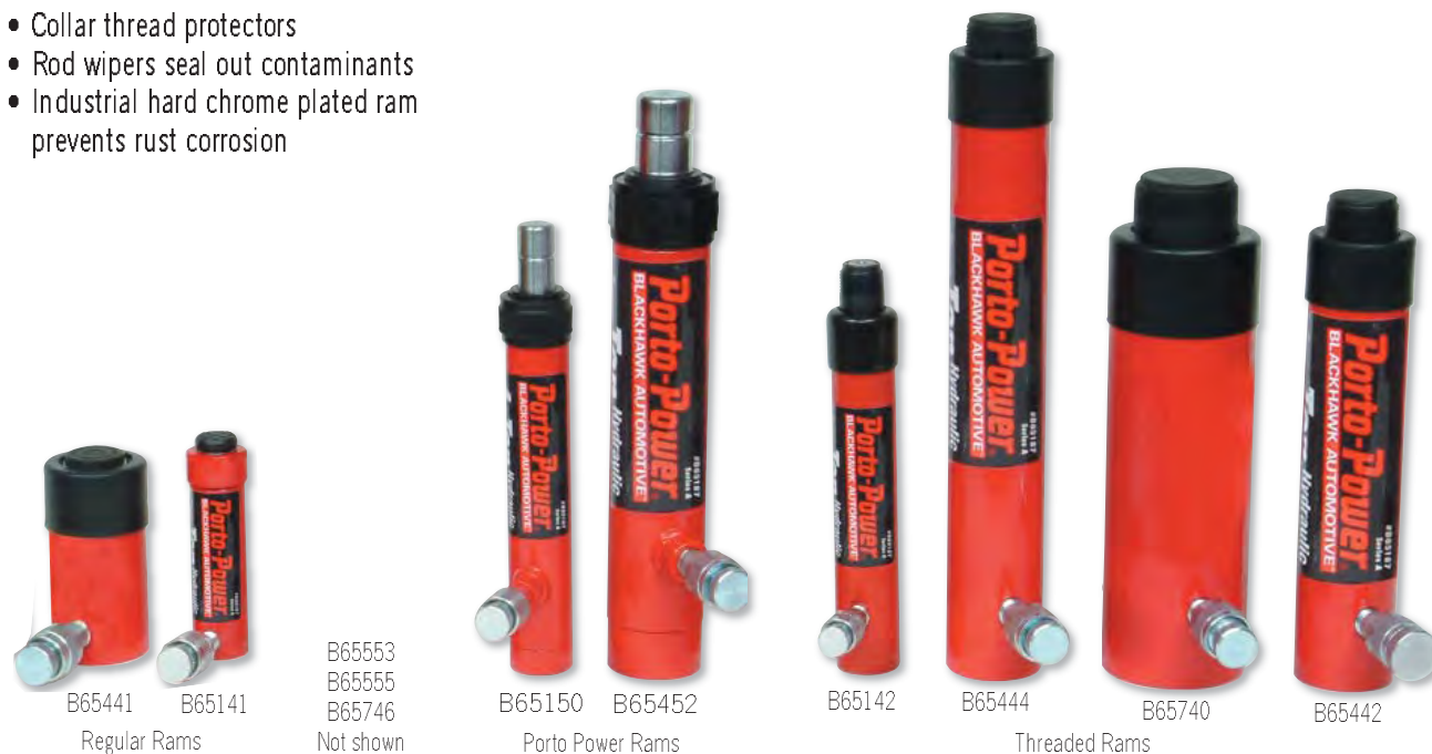
B65441 B65141 Regular Rams