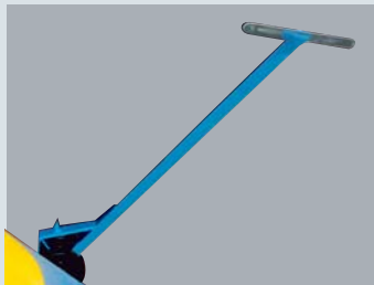
Semi-Live Dolly Jack