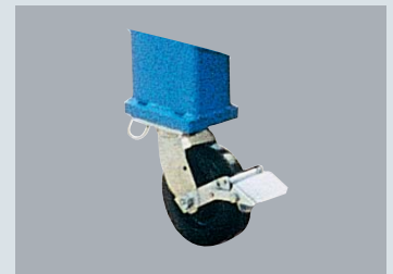
Caster Frame Assembly