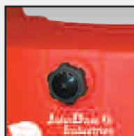
Vented Gas Cap