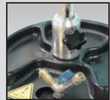
Poly-molded tool tray is mounted on top of the tank for easy access to tools and fittings.