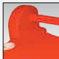
Molded-In Handle 2" Bung Opening