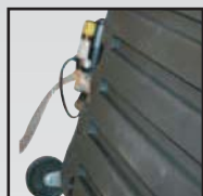
Reinforced floor posts add strength.