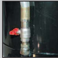
Separate shut-off valve prevents spills.