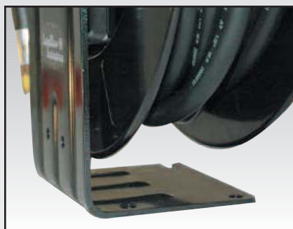
7" wide "L" shaped base for positive support.