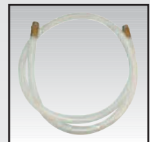
6' quick-disconnect discharge hose for permanent attachment to a storage tank allowing drain to move around freely in the shop.