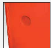
Molded-In Baffle for Tank Reinforcement