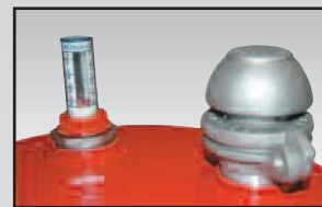
Gas Caddy includes vent cap and fill level gauge.

Height ..... .46" w/pump Width ..... .21" Depth ..... .21" Wheels ..... .8" x 2.75"