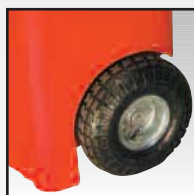
10" Heavy-Duty Tire & Wheel