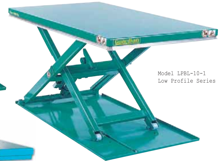
Model LPBL-10-1 Low Profile Series