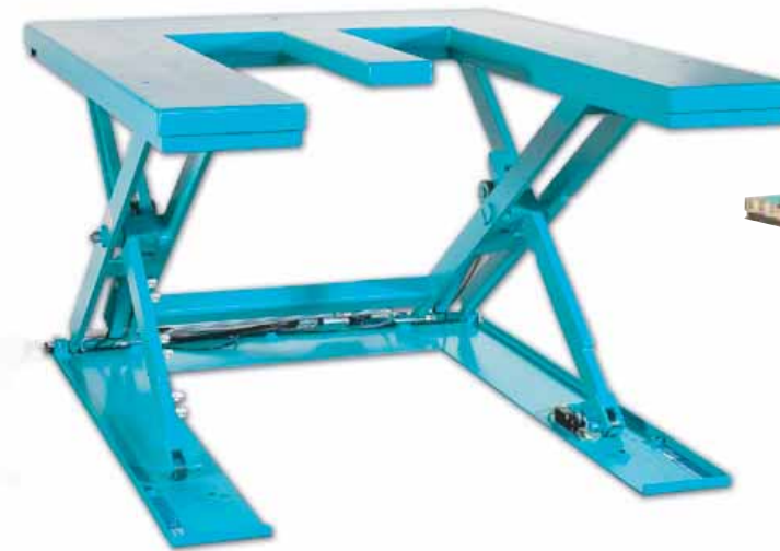
Model LPBLE-20-1 Low Profile "E" Shaped Series