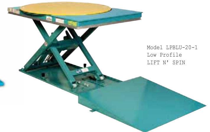
Model LPBLU-20-1 Low Profile LIFT 'N' SPIN