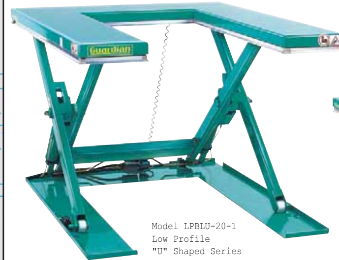
Model LPBLU-20-1 Low Profile "U" Shaped Series

A New Line of Lift Tables Offering the Ultimate in Safety and Convenience