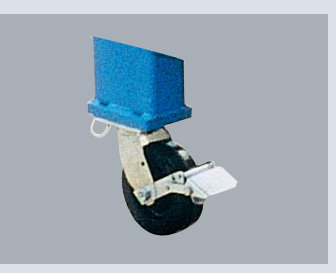
Caster Frame Assembly