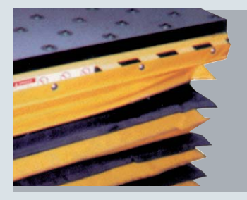
Accordion Safety Skirting