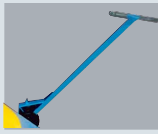
Semi-Live Dolly Jack