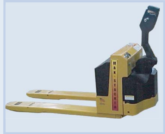
MXPPT-45 Electric Pallet Truck

In-Semi turn around can be easily accomplished because of this feature combined with a short chassis length.