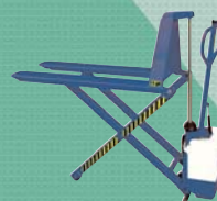
MAXX-JACK Electric High Lift