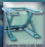
Guardian Series U-Lift Table