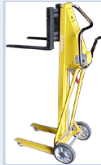
MAX-STACKER MINI LIFT

Model: PM120 Capacity: 250 lbs. Lift Height: 41" Lowered: 3.75" Fork Length: 15.75" Individual Fork Width: 2" Fork Width Adjustment: 13.5" to 19" Load Wheels: 2" Steer Wheels: 8" Weight: 68 lbs.