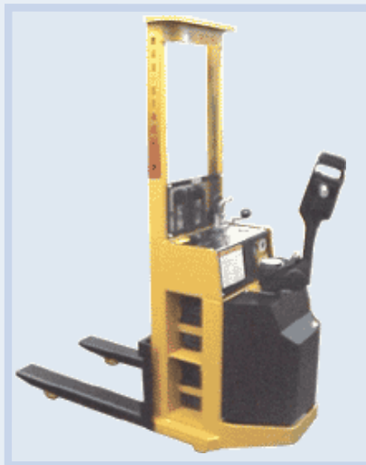
Rigid Fork Over Models

When a manual push unit isn't enough, the intermediate MXPDI series can handle the job. With the 3-speed forward and reverse (Optional solid state) it is easy to move loads up to 2,000 lbs and lift as high as 12 feet. Available in either the straddle design or the rigid fork over straddle models. With 20 models from which to choose the MXPDI series can handle most jobs within the 2,000 lb range.