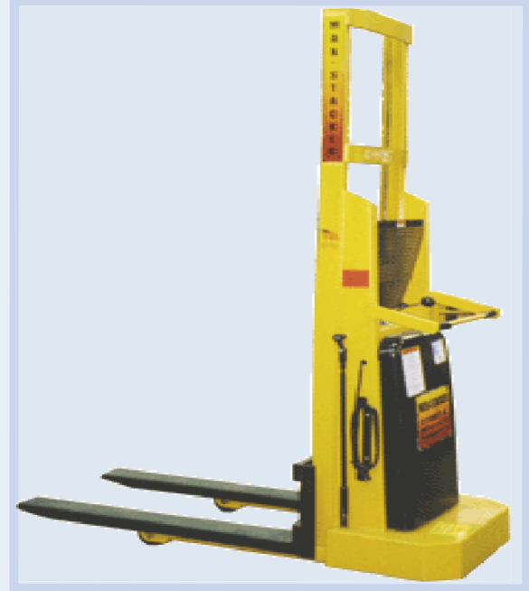
MXIBH Rigid Fork Over Models

These are seven of our most popular models. There are many more models to choose from. Contact our office or visit our website for more information.