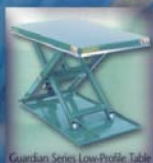
Guardian Series Low-Profile Table