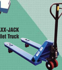
MAXX-JACK Pallet Truck

13000 W. Bluemound Rd. PO Box 349 Elm Grove, Wisconsin 53122-0349 262-860-1895 • FAX 262-860-1894 Toll Free 877-LIFTPRO (877-543-8776) www.liftproducts.com