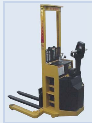
Straddle Adjustable Forks