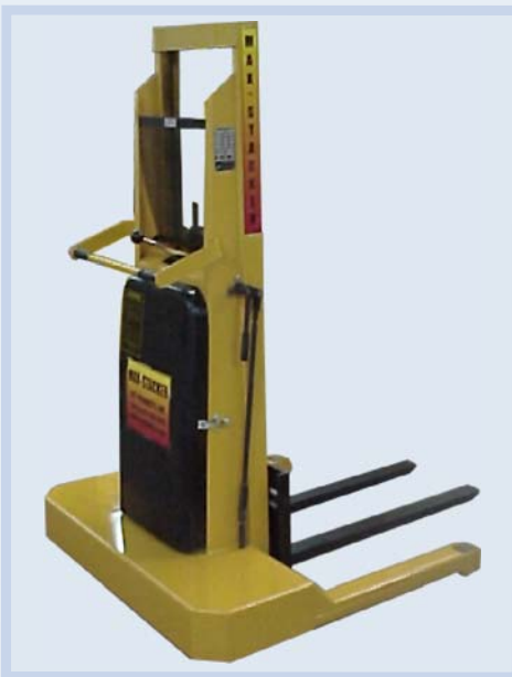
MXIBH STRADDLE LIFT

The Max-Stacker MXIBH series is a manual push powered lift series of trucks. Ideally suited for those applications with lighter loads and short travel distances that do not require a self-propelled unit. Whether its pallet handling or special use with one of our many options this is an inexpensive way to solve your material handling or ergonomic needs. The adjustable fork models with outboard straddle legs allow the lifting of pallet loads with bottom boards. This series also allows greater lift height of up to 12ft and can handle most standard pallets. The rigid fork model (see page 3) is suited for those requirements such as lifting wire baskets, containers or pallets with open bottoms. This design allows for close access to the load for the outrigger is located under the fork. With over 50 models to choose from and a large variety of options this series can be custom fit to your application. Contact our factory with your requirements.