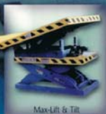
Max-Lift & Tilt