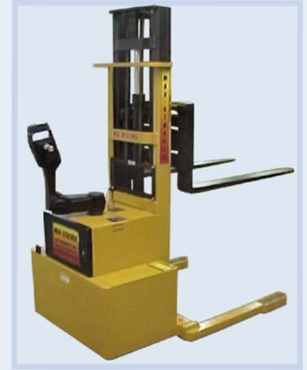
Adjustable Model With Adjustable Fork

Adjustable straddles, full free lift mast, solid-state controls and remote lift and lowering are just a few of the options available to customize this unit to suit your specifications.