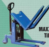
MAXX-MOBILE Tilt & Lift