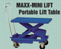
MAXX-MINI LIFT Portable Lift Table