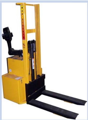
Rigid Fork Over Model

These are six of our most popular models. There are twenty models to choose from. Contact our office or visit our website for more information.